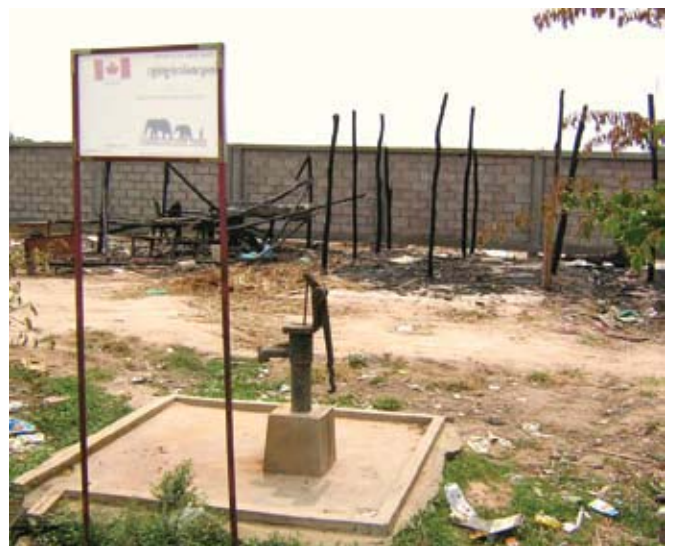
A JWOC water well, across from the origin of the fire, was used to prevent further damage to adjacent homes.