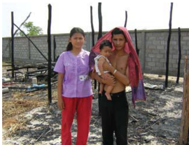
Village residents stand in front of the remains of their home that was destroyed in a fire in Siem Reap.