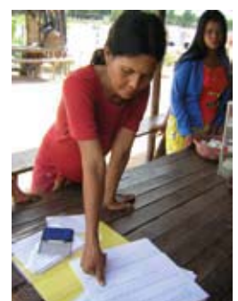
JWOC Dollars for Scholars students give new loans to villagers to start and expand small businesses.