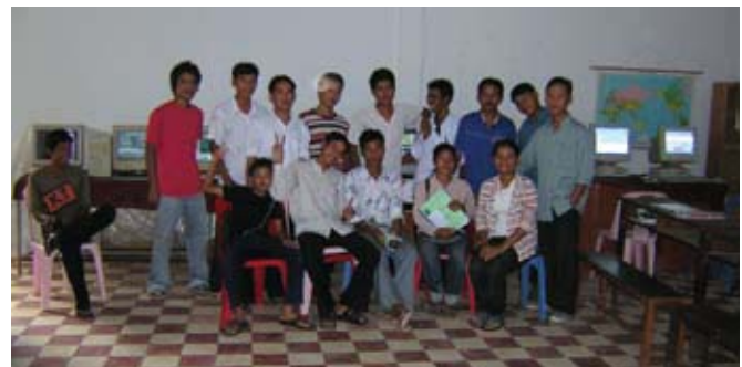
Students studying computers take a break for a quick photo.

The new donation amount for one water well is $100, which does not include a sign. For an additional $25, JWOC can make a sign with wording of your choice. (The sign is now optional.)